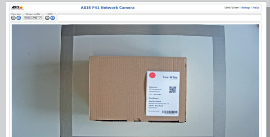
Example: Color detection on shipping label