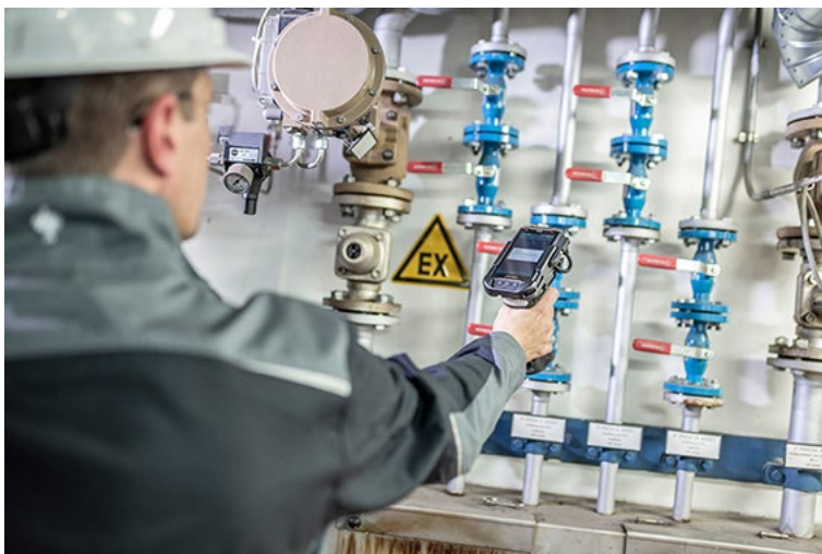
fig. 2: Mobile data management in Ex-areas.